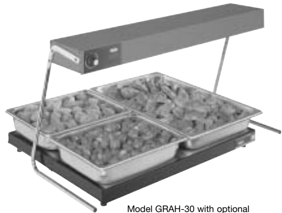
Model GRAH-30 with optional Designer color and infinite switch and accessory C-Leg stand over Heated Shelf model GRS-24 in optional Designer color

BLANKET ELEMENTS GUARANTEED AGAINST BURNOUT AND BREAKAGE FOR ONE YEAR.