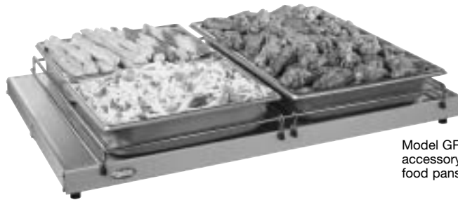
Model GRS-30 with accessory pan rail and food pans