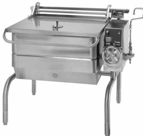
Model BPM-40G shown

A heavy-gauge, fully-adjustable one-piece cover is standard with torsion bar type counterbalance designed to maintain the selected cover position. A vent is provided in the cover top to regulate condensate buildup and a rear condensate drip shield is located under the cover to prevent condensate from dripping on floor when cover is opened.