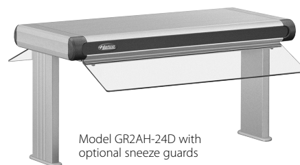
Model GR2AH-24D with optional sneeze guards