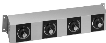
Model RMB-14D with infinite controls