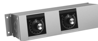
Model RMB-7C with infinite controls

METAL SHEATHED ELEMENTS GUARANTEED AGAINST BURNOUT AND BREAKAGE FOR TWO YEAR.